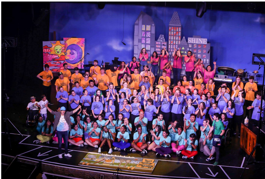
SHINE February 2020

Our core after-school program, the CREATE Performance Group was invited to join Grammy-winner Jason Mraz in a new musical adventure, SHINE . Twenty-five students and alumni performed two sold-out shows at the Spreckels Theatre in February 2020 alongside Jason and other youth arts groups. The powerful show was adored by audiences. The CREATE Performing Group is free for students. It is designed to provide transformative experiences for youth considered at-risk for unsafe behaviors.